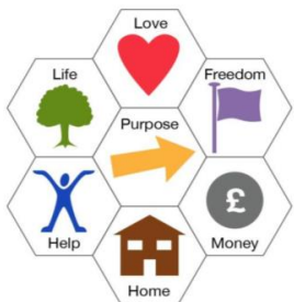
The 7 Keys to Citizenship

In September 2021 Inclusion North recruited a team of 5 people to deliver the Citizenship Project. The Team included a Project Worker and four people with lived experience.